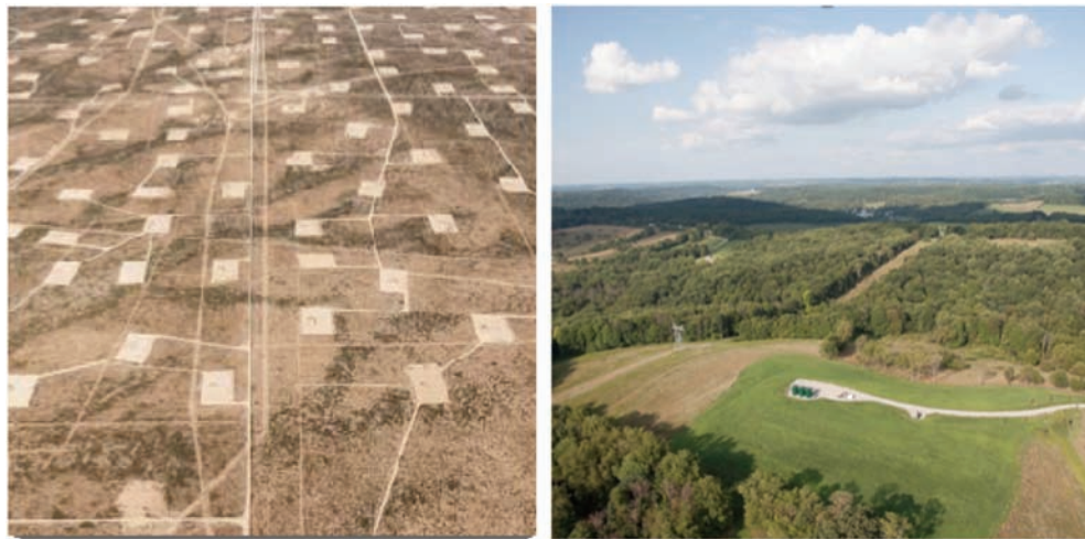
Figure 2 Innovation in well design and operation. Left: old single well spacing (Texas); right: modern multi-well cluster configuration accessing gas from an area of up to 10 km 2 (Pennsylvania).